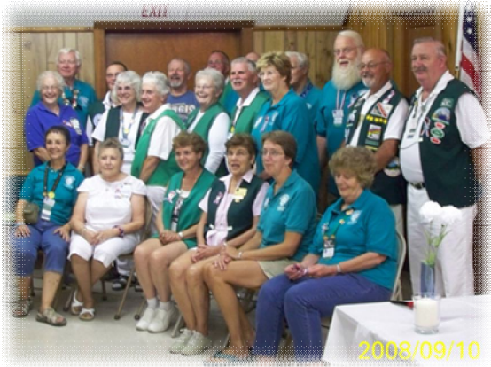
Evergreen's at the WA State Rally